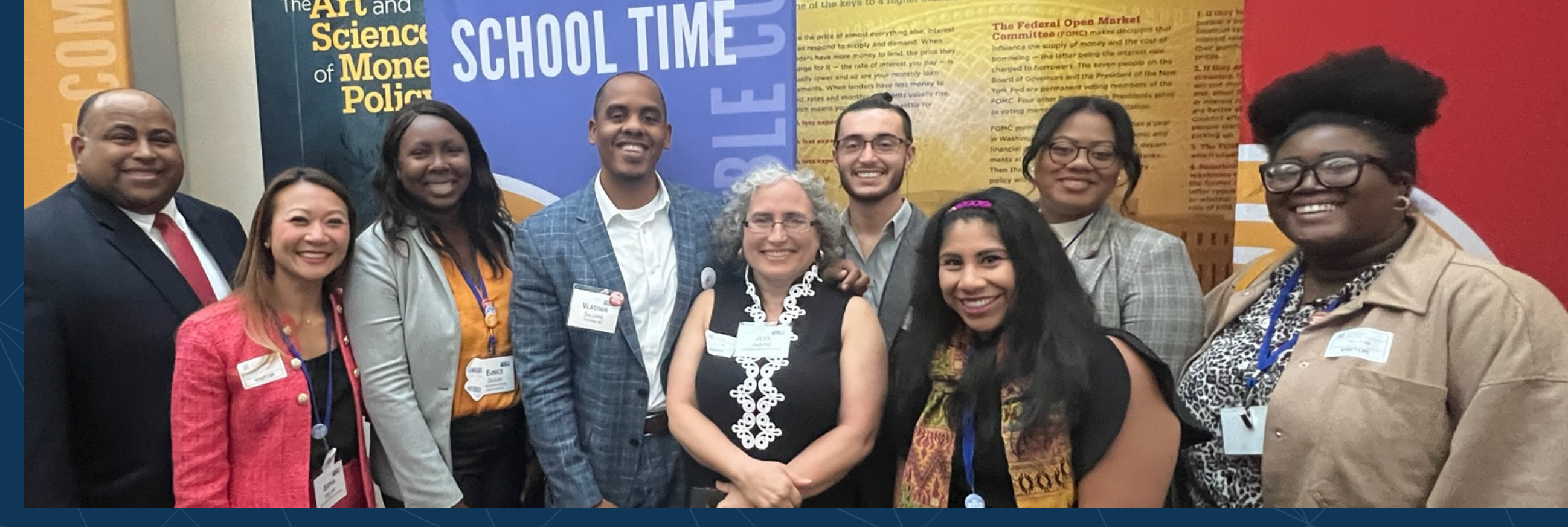
Celebrating community-centered organizations with United Way of Massachusetts Bay.

Born out of a merger of the Massachusetts Industrial Finance Agency and the Massachusetts Government Land Bank in 1998, MassDevelopment became the Commonwealth's resource of choice for businesses and communities in search of financing or real estate assistance. As a unified organization we could more effectively provide innovative financing packages for growing companies, nonprofits, and housing developments as well as deliver creative solutions to challenging economic development projects.