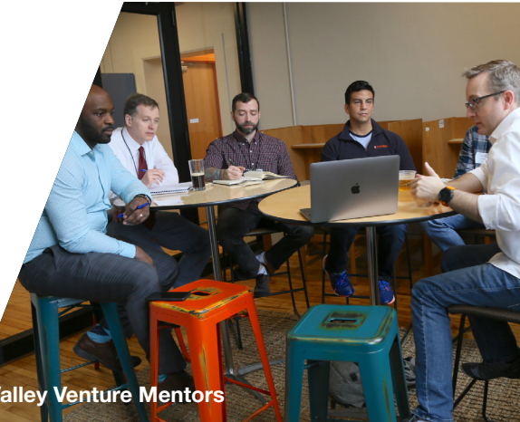
Valley Venture Mentors

Valley Venture Mentors provides mentoring to entrepreneurs and startups. The funds will be used for furnishings, equipment, and a security system for the Valley Venture Hub coworking space.