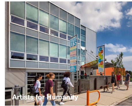
Artists for Humanity

Studio for Integrated Craft is a collaborative workspace in a repurposed mill, founded with the goal of fostering a professional creative community. The grant will be used for renovations including architectural, structural, and electrical engineering; removal of heavy existing machinery; masonry work; and roof repairs.