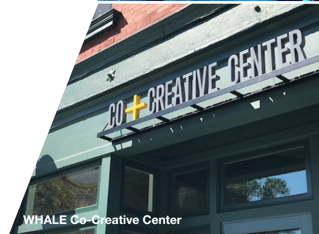
WHALE Co-Creative Center