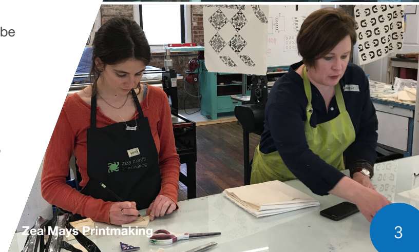
Zea Mays Printmaking