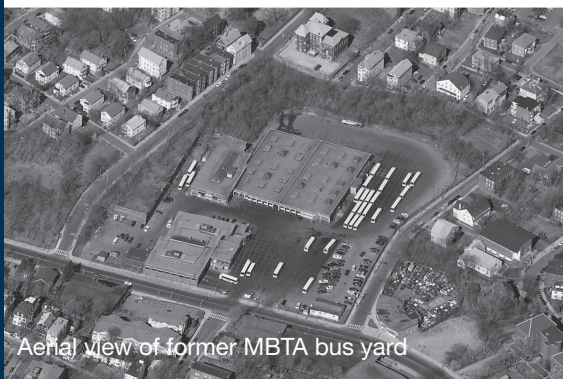
Aerial view of former MBTA bus yard

Once an MBTA bus yard, the former eight-acre brownfields site now known as Bartlett Station is the largest-ever mixed-income, mixed-use development in Roxbury. When complete, 323 new apartments, condominiums, and townhomes (216 affordable, 107 market-rate), plus 50,000 square feet of retail and office space for local entrepreneurs, will enhance this Dudley Square neighborhood. Commercial tenants will include a grocery store and fitness center, while the centerpiece of Bartlett Station will be the Oasis@Bartlett, an active and vibrant outdoor park scheduled to open in 2021 with a focus on supporting local artists, nearby audiences, and neighborhood businesses.