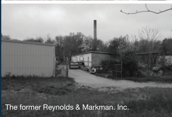
The former Reynolds & Markman, Inc.

The Attleboro Redevelopment Authority (ARA) received a $500,000 remediation grant from the Brownfields Redevelopment Fund in fiscal year 2019 to clean up the former Reynolds & Markman site located within the city's Intermodal Transportation Center (ITC) Urban Renewal Area.