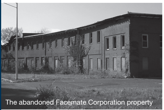
The abandoned Facemate Corporation property

Located on a portion of the former Facemate Corporation property in Chicopee, the newly constructed River Mills Assisted Living at Chicopee Falls sits on a four-acre development parcel adjacent to the new RiverMills Senior Center. The Facemate property was originally developed in the 1800s for textile manufacturing, with operations ceasing permanently in 2003. An investment of a $2 million grant from the Brownfields Redevelopment Fund has now leveraged more than $40 million in funding from public and private sources for assessment, remediation, demolition, and construction costs. River Mills Assisted Living at Chicopee Falls is a three-story, 80,000-square-foot building with 73 assisted-living units and 22 memory-support apartments, with 20% of the total units designated as affordable. The project combines thoughtfully designed spaces with high-quality assisted-living amenities and affordability, on a historically relevant site.