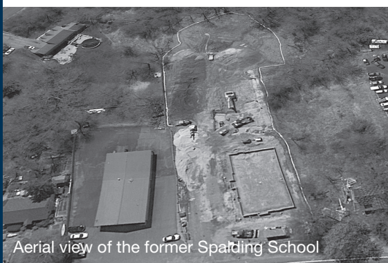
Aerial view of the former Spaulding School

The YWCA of Greater Newburyport and its development partner, L.D. Russo, transformed a former school building in Salisbury and a vacant municipally-owned lot (formerly a shoe factory) into 42 units of affordable housing in two separate buildings. A $100,000 remediation grant from the Brownfields Redevelopment Fund allowed the Town of Salisbury to clean up the site and achieve a Permanent Solution within the meaning of the Massachusetts Contingency Plan. The $12.3 million project was completed this past summer allowing residents to move in and enjoy green space amenities, architectural details including exposed brickwork from the original building, central air conditioning, and more.