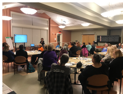
Franklin Community Workshop 2019