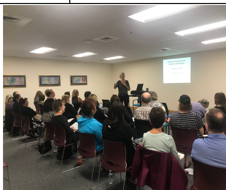
Acton Community Workshop 2019