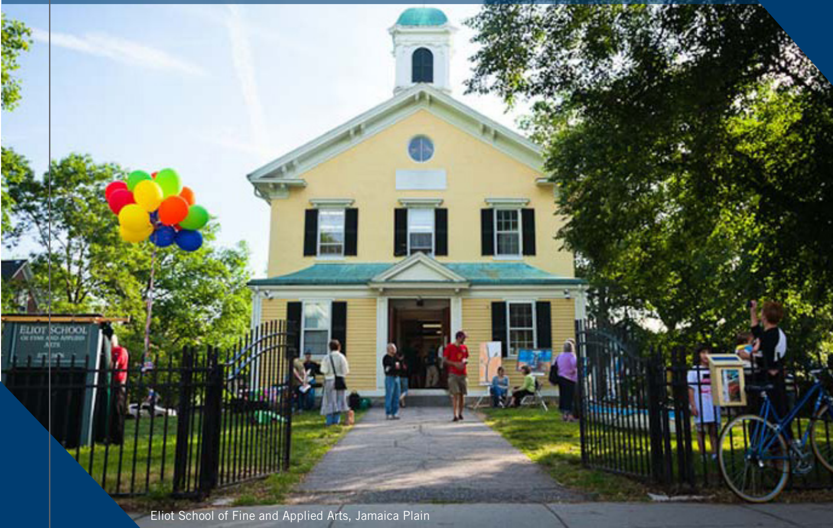
Eliot School of Fine and Applied Arts, Jamaica Plain