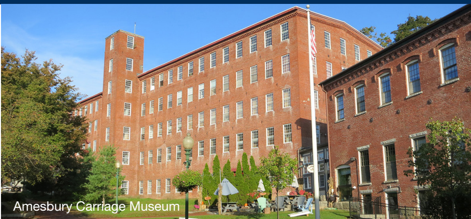
Amesbury Carriage Museum