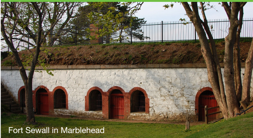
Fort Sewall in Marblehead