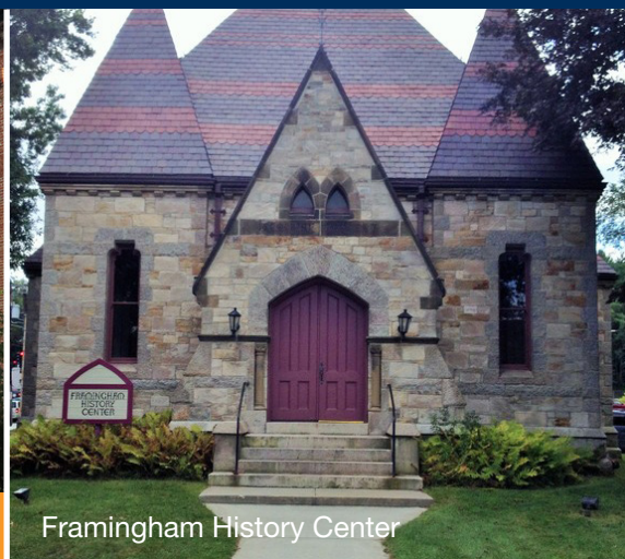
Framingham History Center