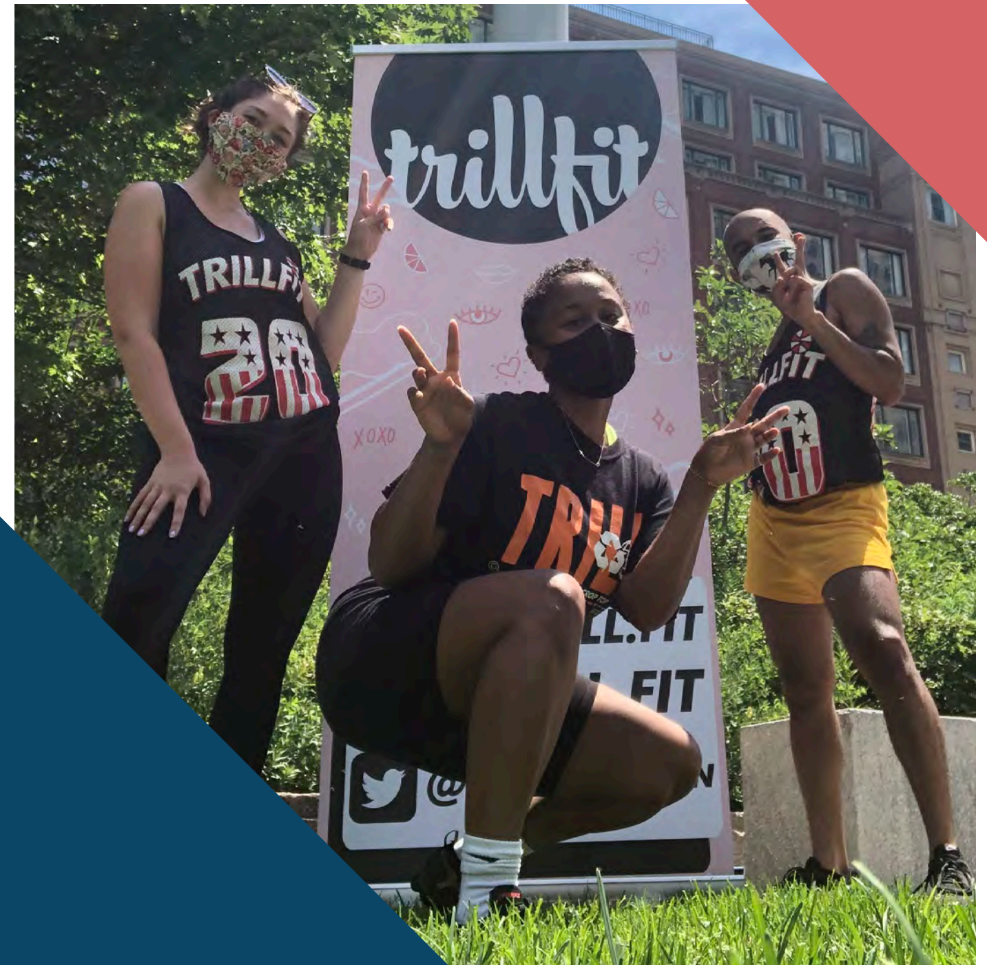
TRILLFIT Cardio Dance