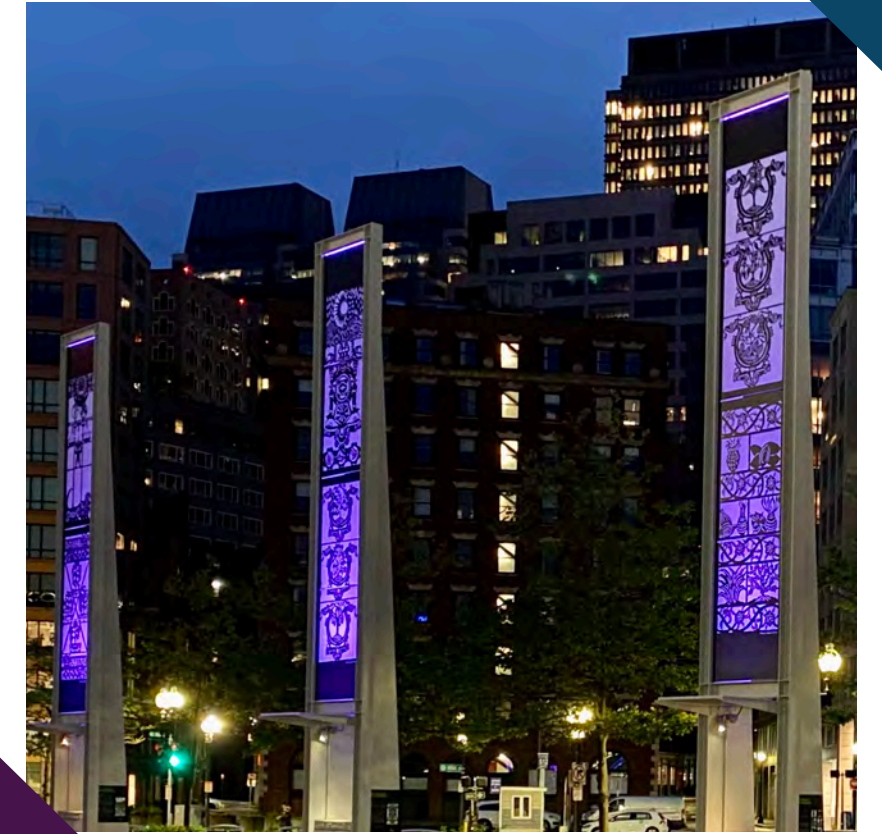
Global Connections: Mesoamerican Myths, the Domestication of Nourishment, and its Distribution