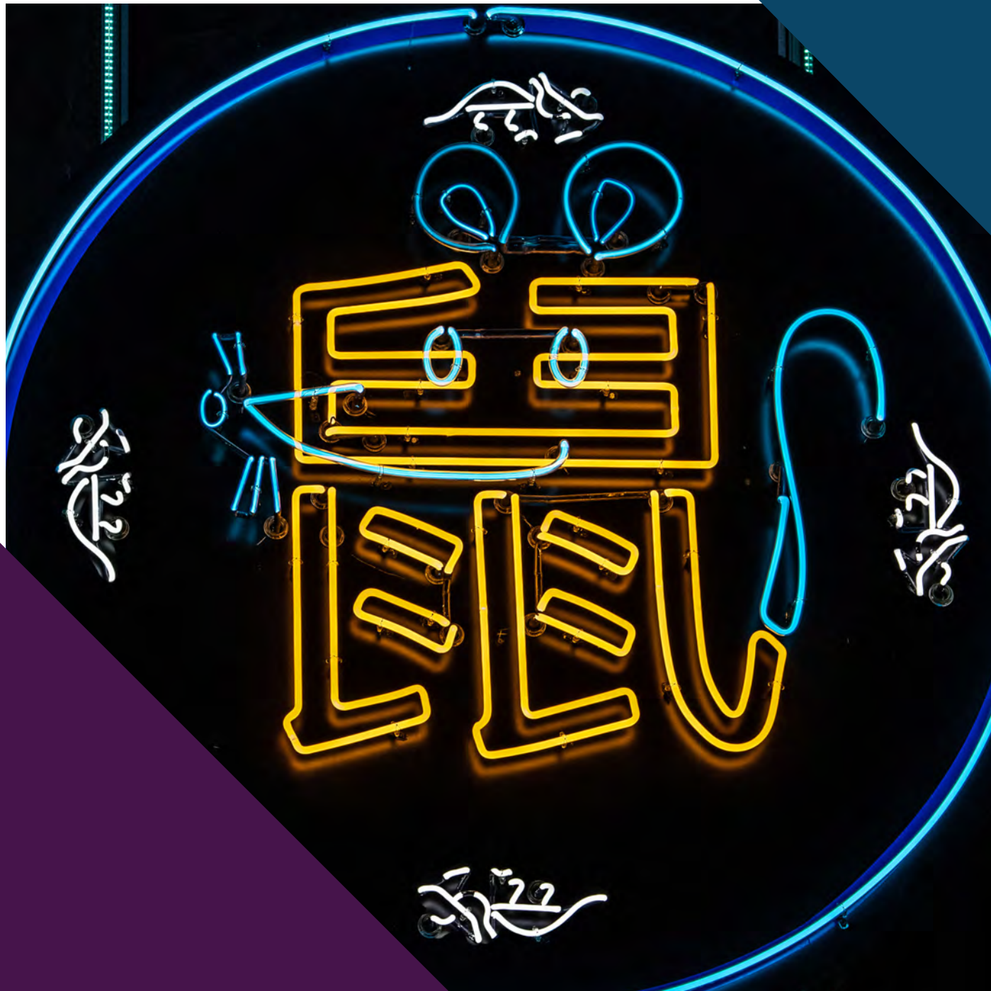
A Mouse with Ears and Tail