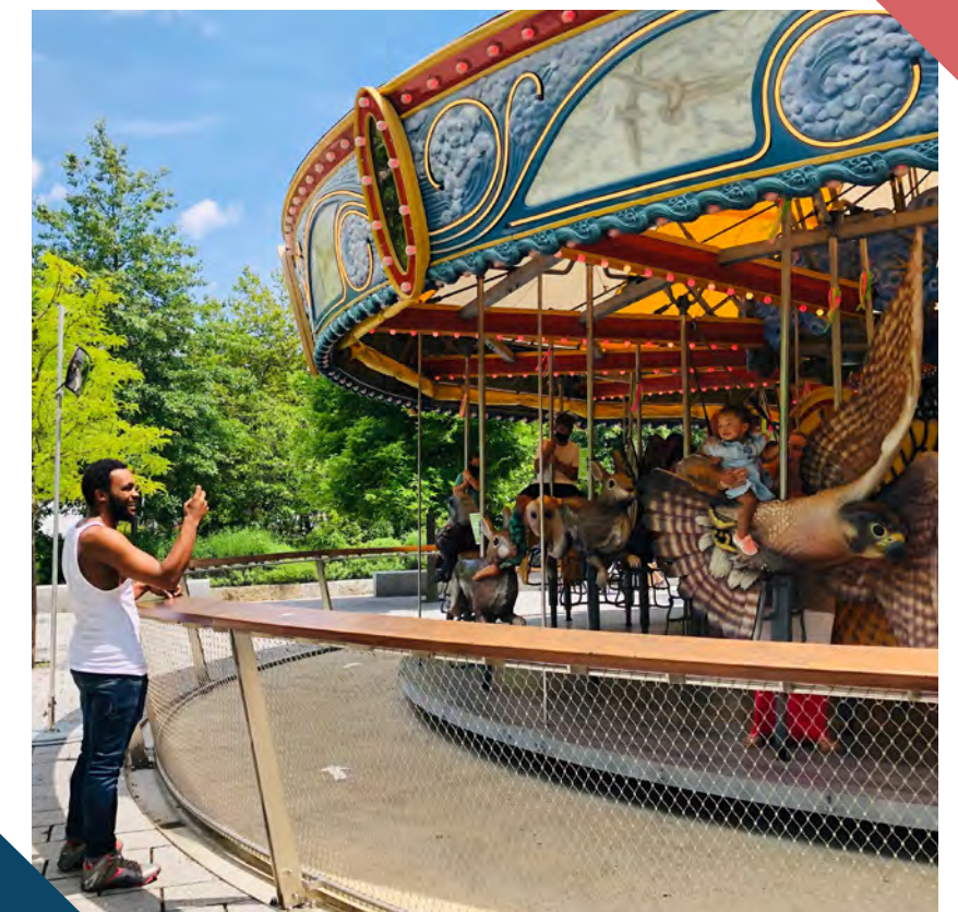
The Greenway Carousel at The Tiffany & Co. Foundation Grove