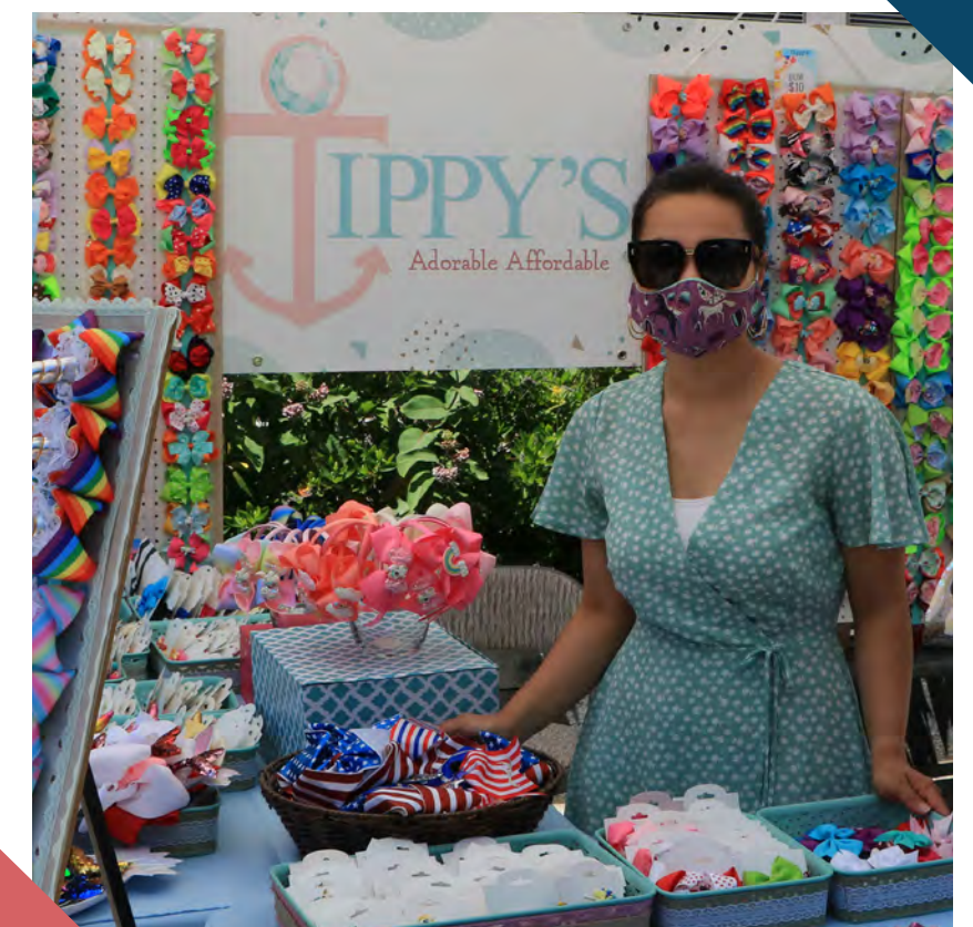
Greenway Artisan Market