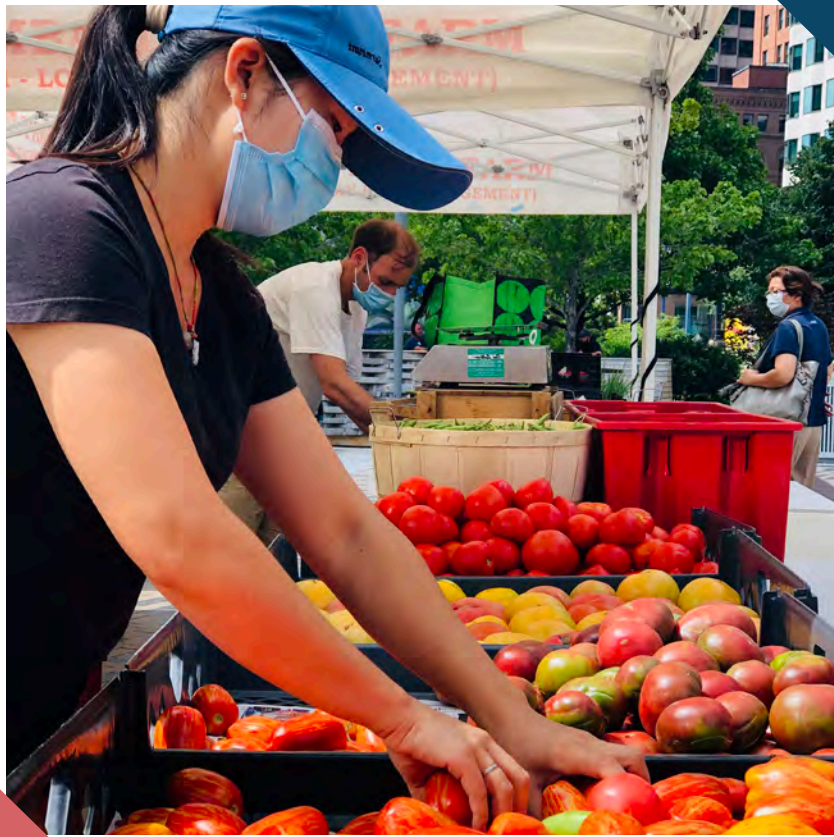
Boston Public Market at Dewey Square