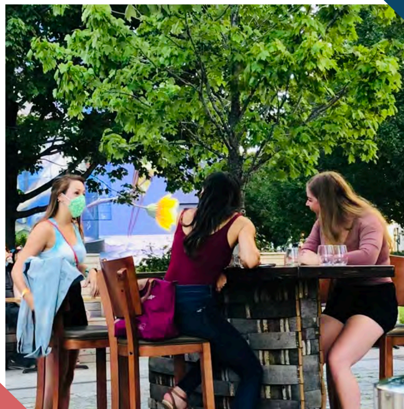
City Winery on The Greenway