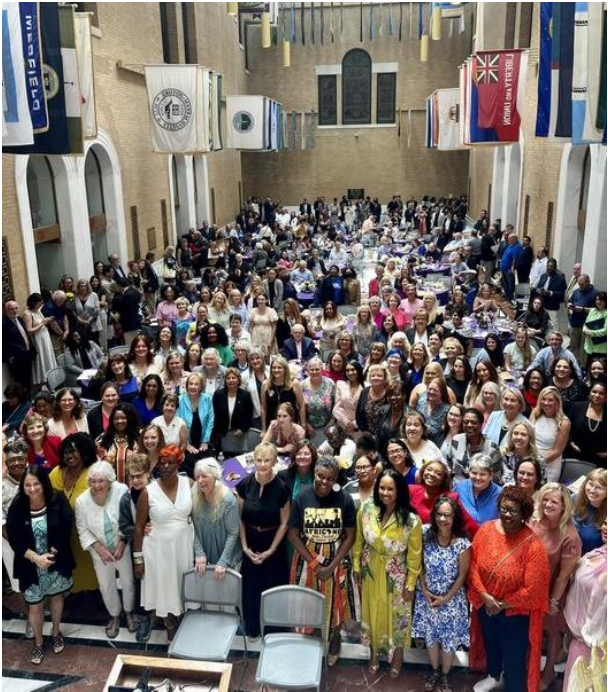
Pictured above: Commonwealth Heroines Class of 2023

Each year the Commission partners with state legislators to identify women who make outstanding contributions to their organizations and communities. This year, we anticipate honoring more than 125 Commonwealth Heroines as a part of the Class of 2024 at a celebration taking place on June 14, 2024 at the Massachusetts Statehouse. For the first time, we received a nomination from a Congressional member of Congress, U.S. Senator Elizabeth Warren. Congratulations to the Class of 2024!