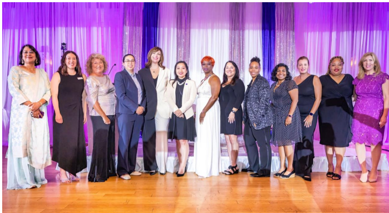
MCSW Commissioners celebrating at the organization's 25th Anniversary Gala