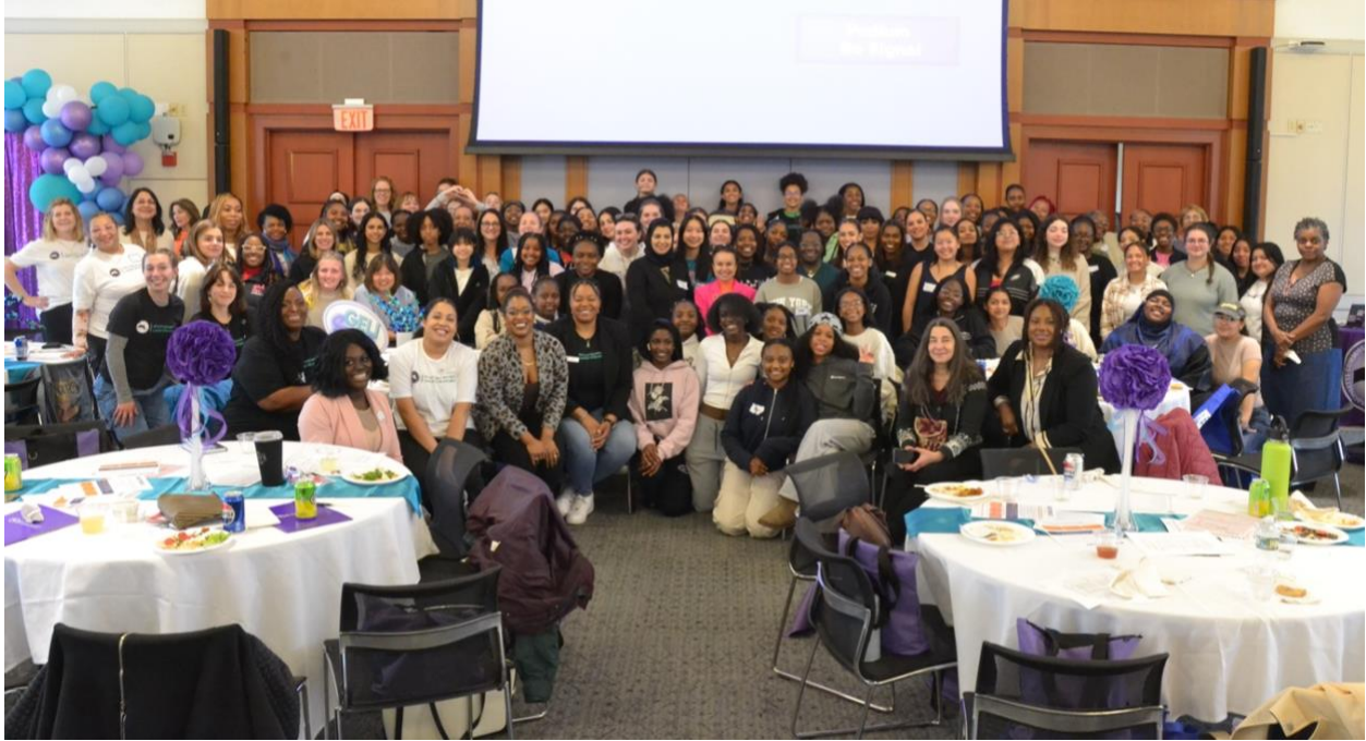
The Girls Empowerment Leadership Initiative (GELI) 2024 Summit