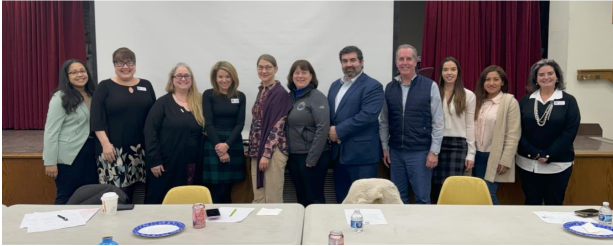
The Berkshire County Commission met with their state legislators on January 17th in Pittsfield where they highlighted their legislative priorities and discussed ways to collaborate on two key bills, the Healthy Youth Act and the Act Relative to Language Access and Inclusion.