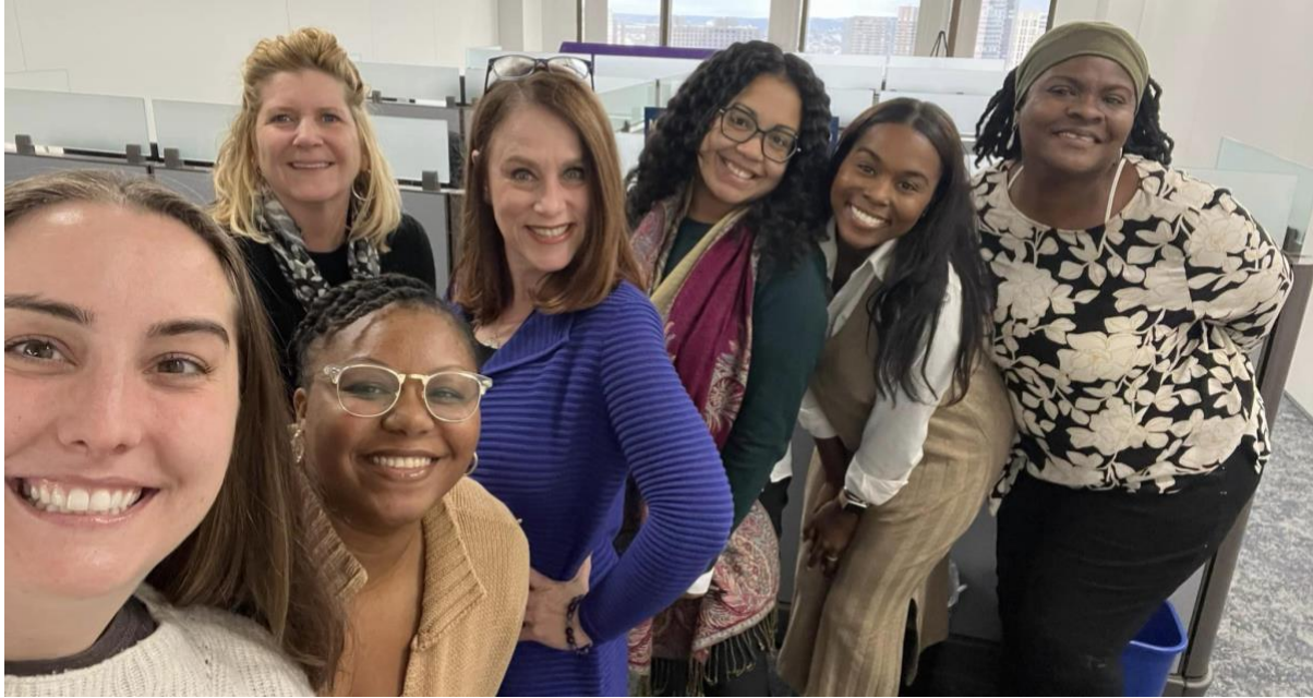
FY24 MCSW Staff