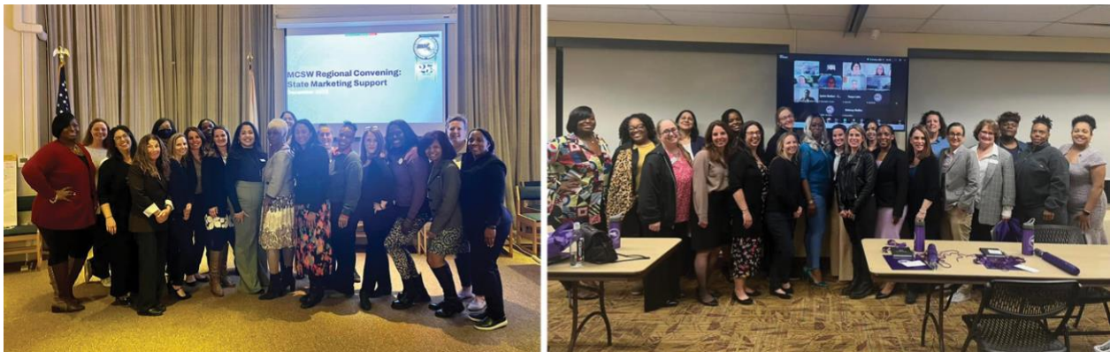
MCSW hosted two successful Regional Convenings, the first on December 6th at Mass Bay Community College in Wellesley, and the second on May 1st at Springfield Technical Community College in Springfield - where Regional and State Commissioners gathered for an evening of learning and networking.

Our Regional Convenings continue to be well-received by our regional and state commissioners – and we always look forward to hearing from our regional commissions on what topics they would like to learn more about and what networking opportunities they would like to experience with each other.