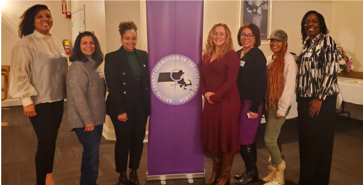
The Bristol County Commission held their annual planning retreat on January 29th in Foxborough, settling on maternal health as their primary legislative focus. They mapped out plans for a spring public hearing and discussed their intention to launch a girls' advisory council.