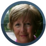
Senator Eileen M. Donoghue @EileenDonoghue

This measure was sponsored by Senator Eileen M. Donoghue (D-Lowell)