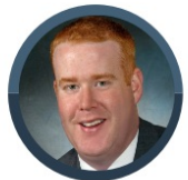
Senator James T. Welch @Sen_Jim_Welch

Chair, Special Senate Committee on Opioid Addiction Prevention, Treatment and Recovery Options